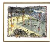
Regardless of the weather, the grass is still green (2024) Pencil, ink and embroidery on cotton, mounted and framed behind UV glass. 928 x 1118 x 62 mm.