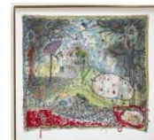
Unreal Dreaming (2024) Pencil, ink and embroidery on cotton, mounted and framed behind UV glass. 928 x 1118 x 62 mm.