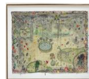
The Prevailing Storm (2024) Pencil, ink and embroidery on cotton, mounted and framed behind UV glass. 868 x 1038 x 62 mm.