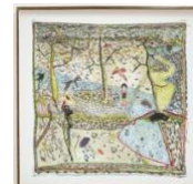
Forgotten Dog (2024) Pencil, ink and embroidery on cotton, mounted and framed behind UV glass. 848 x 833 x 62 mm.