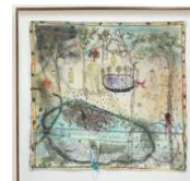
Dreaming of other worlds (2024) Pencil, ink and embroidery on cotton, mounted and framed behind UV glass. 978 x 998 x 62 mm.