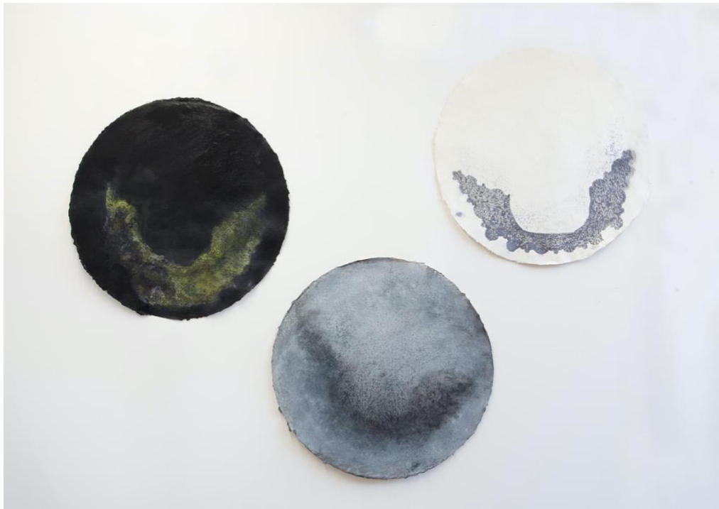
Untitled (3 Tondos) (2021)

Ink on found quilt, embroidery in wool and cotton thread, 150 cm x 200 cm.