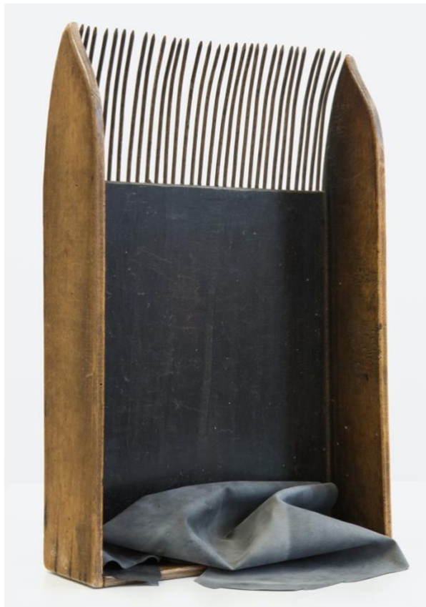
Untitled (2019) Latex on agricultural tool, 38 cm x 25 cm x 8 cm