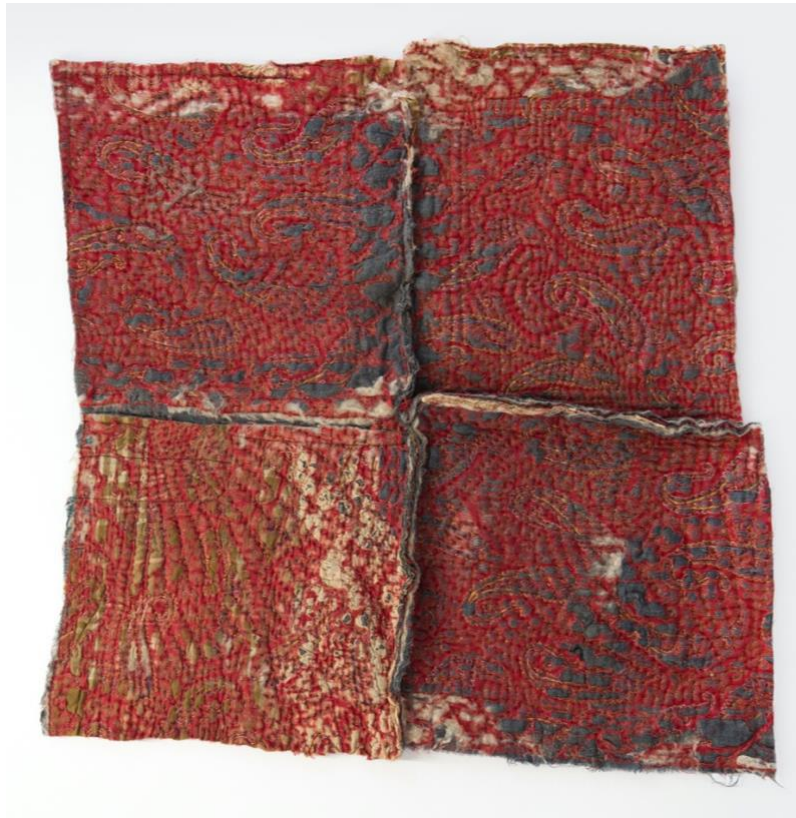
Untitled (Red quilt) (2021) Cotton embroidery and pva on cotton and wool, 90 cm x 86 cm.

LUNGLEY Gallery is pleased to present Recent Drawings and Fabric Works , a solo exhibition by Maya Balcioglu.