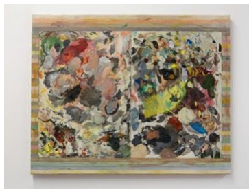
Stuart Brisley Palettes from The Museum of Ordure 14/08/2020 – 16/04/2021 Completion Acrylic and golden acrylic medium on linen, 50.5 cm x 40 cm