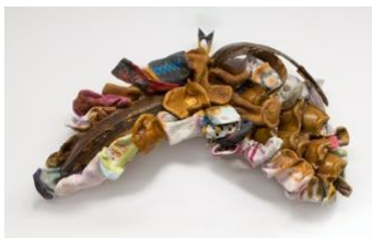
Lana Locke Pangolin-Bat (2020) Mixed media relief, 26 cm x 47 cm x 9 cm