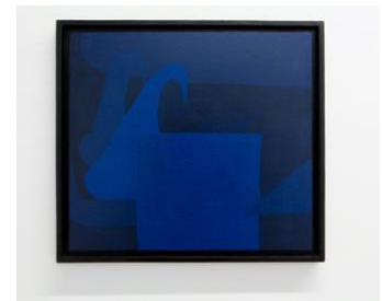
Jack Killick Creep (2020) Acrylic on board, 34 cm x 38 cm Float mounted and framed