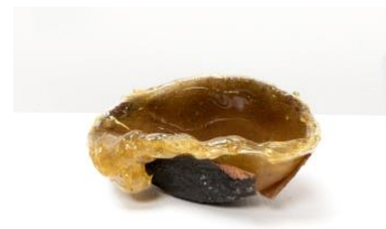
Lana Locke Avocado slime (2020) Glass wax and avocado skin, 5 cm x 11 cm x 6 cm