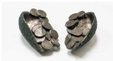
Lana Locke Avocado and coins (ii) (double) (2012) Bronze, 5 cm x 16 cm x 12 cm