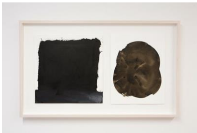
Maya Balcioglu Untitled (Diptych) Left to right: Untitled (1998) Ink on paper, 37.5 cm x 37.5 cm Untitled (2020) Ink on paper, 30 cm x 38 cm Float mounted and framed