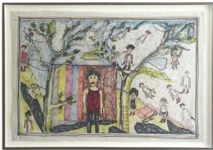
Brian Dawn Chalkley Blue Horizon (2021) Pencil and felt tip on cotton pillow case, 65 cm x 50 cm. Float mounted, framed UV glass.