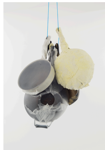
Thomas Greig: Frying pans (2018) Frying pans, dust, plastic, tissue, acrylic paint, wire. Dimensions variable.

In an age of crumbling symbols and broken icons All or nothing focuses on a specific form of contemporary art practice that juxtapose disparate elements for suggestive effect. Works made up of fragmented forms display a distinct informality; exploiting the power of found images and materials to communicate the unease, displacement, peculiar to our times.