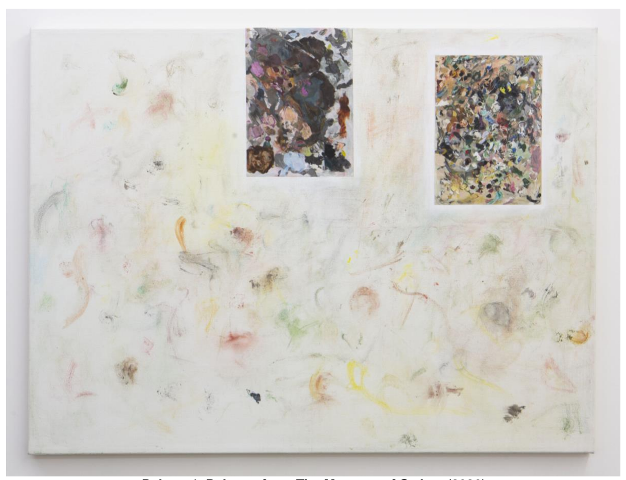
Palette:1, Palettes from The Museum of Ordure (2020) Acrylic on gesso on canvas, 92 cm x 122 cm.

The interest in making works lay elsewhere. I needed a palette to mix paint on and for no other reason. I did not clean them after each session which is the usual practice because I have worked with acrylic which dries or can dry quickly. When the works were completed on both sides of the foam board I made another identical palette. I cut them from the usable areas of a battered foam board sheet. I previously thought of the palette as a receptacle, a ground for preparation to mix pigments, paints and mediums. The fact that the palettes I used were not cleaned and were replaceable did eventually lead me to consider them as vehicles for the production of works of art. I became fascinated by the prospect of using 'facsimiles' of a thing that was to be part of the process of making and seemingly had no other value.